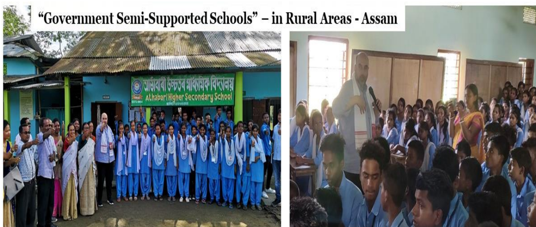
Figure 4. Illustrates Government Semi-Supported Schools in rural areas in Assam, where the school would have very limited resources to deliver formal education

Bihar. These are innovative and successful examples of schools running in rural India. It is the time to replicate such efforts as our country, and its rural population is very vast, which means one of two stories of these kinds will not make any difference. Instead of this large number of such schools are required in rural India. It is also absolutely mandatory to evaluate the success of the schools and students at every level. Timely assessment will throw light on present problems and achievements. Let us try to build a solution around these problems which will resolve the overall issues of rural education in India.