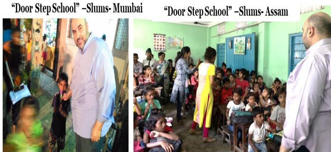
Figure 2. Illustrates 'Door Step School' visits on two different slums areas in Mumbai and Assam