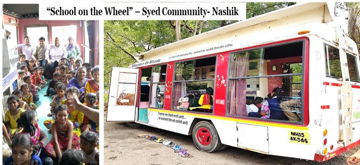
Figure 1. Illustrates School on the Wheel parking in a shaded area near the tribal huts of Syed Community

This type of approach addresses the need for an immediate solution, or means of education and learning services that can be delivered on site, to mitigate the risk of having more marginalised children in India that are receiving little or no education. Alternatively, addressing specific children of community high dropout rates. Figure (1) shows the field visits to school on the wheel approach in Nashik.