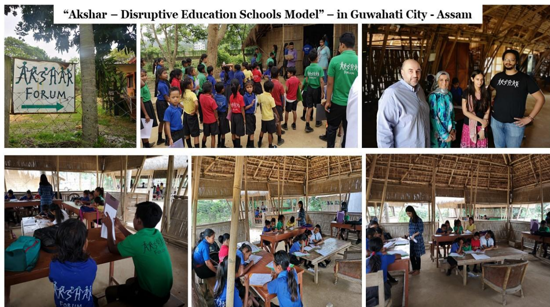
Figure 6. Illustrates one of the Innovative Disruptive Education Model School approach, usually led by Social Entrepreneurs. This model called Akshar is delivered in the Capital of Assam, Guwahati

Akshar is one of the unique, simple, innovative, disruptive educational approaches that are focused on improving the level of educational outcome delivered to the underprivileged through strong educational initiatives led by the NGOs and social entrepreneurs in India. Akshar target to close the gap of the children from low-income families through building on the unique learning capacities that would help them to cope with life challenges and make a difference. The peer-to-peer approach and modular learning based on the one to one teaching targets to increase the hit rate of the Akshar students to be unique in both theory and practice. This program is similar to programs experienced by the researcher called ‘experiential learning’ approach, which was excluded in this study due to its being tested in leading schools and not necessarily address the poor needs. Figure (6) shows the Akshar model delivered in the suburbs of the Guwahati in Assam.