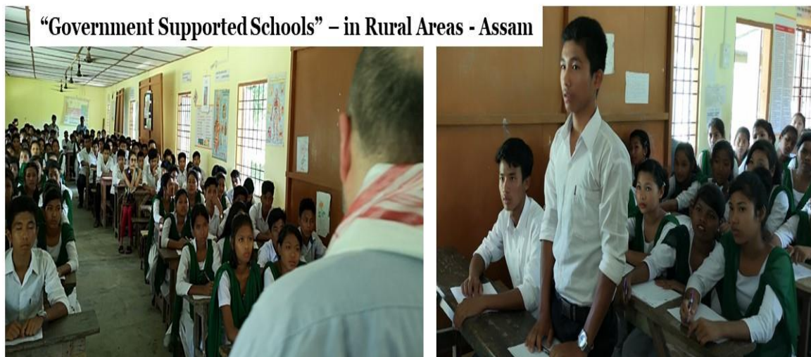
Figure 3. Illustrates Government Supported Schools in rural areas in Assam, where the poor can afford to bring their children to formal education and the school classes would be overcrowded

The observation of the visited rural schools is that they are not evenly distributed as per the population and areas. For example, not every village have schools. The quality access to suitable education is creating major concern in rural schools. Such government supported rural schools approach found to have fewer committed teachers and lack of in proper textbooks. Figure (3) show an example of how government-supported rural schools in India are mostly overly packed with students, with high students: teacher ratio.