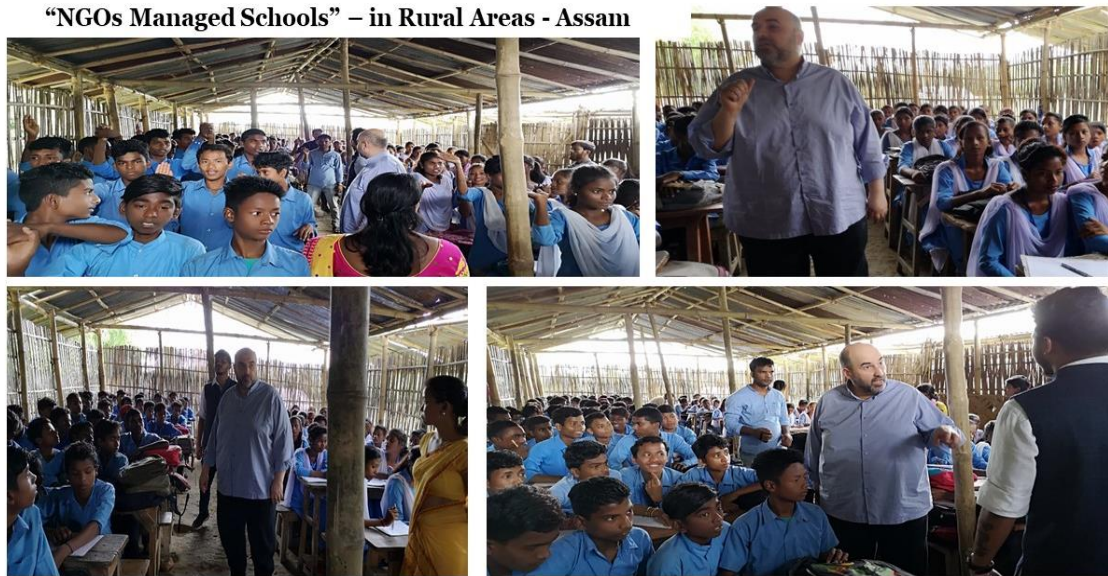
Figure 5. Illustrates NGO fully managed School in rural areas in Assam, striving to deliver formal education with simple construction and overcrowded students