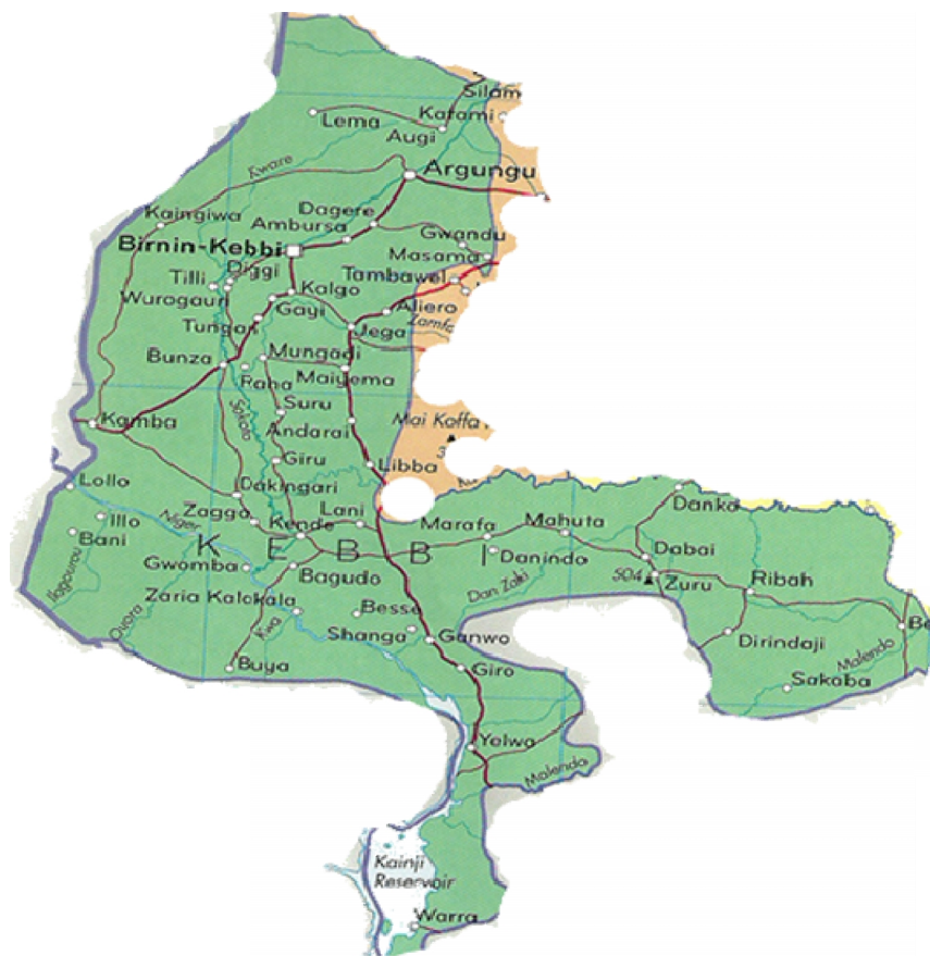
Fig. 1. Map of Kebbi State

Bodiga, Kalli and Labana were located in Aliero local Government area of Kebbi State (Figs. 1 and 2). It is at latitude 12°16' 42"N and 12.27833°N and longitude 4°27'6"E and 4.45167°E.