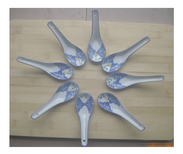
A Integrity of products

Present figure A first (as shown in Fig. 1), then subjects give the bid they are willing to pay. Then present figure B, then subjects give the bid they are willing to pay for the set of tableware.