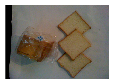
Instruction: see below, this bag of bread. If you buy, how much are you willing to pay? Please fill

Instruction: see below, this bag of bread. If you buy, how much are you willing to pay? Please fill in the number of the price you are willing to pay ______$.