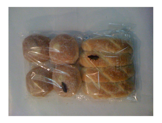
© 2015 Xu et al.; This is an Open Access article distributed under the terms of the Creative Commons Attribution License (http://creativecommons.org/licenses/by/4.0), which permits unrestricted use, distribution, and reproduction in any medium, provided the original work is properly cited.

Instruction: see below, this bag of bread. If you buy, how much are you willing to pay? Please fill in the number of the price you are willing to pay ______$.