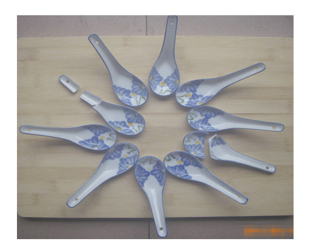
B Imperfect products