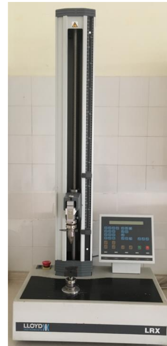
Figure 1. The push-out testing device.

The normality of data distribution was determined using Shapiro-Wilk test. Then the statistical differences between the groups were calculated using Kruskal-