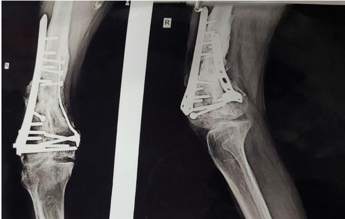
Fig. 1. Showing X-ray of patient's right knee

tenderness was present over dorsal aspect of lower thigh, palpable implant (plate) present over lateral side of knee, knee flexion range of motion was restricted, active ankle and toe movement and the sensations were intact.