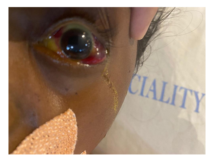
Fig. 2. Showing conjunctival haemorrhage

Fig. 1. Contrast-enhanced computed tomography of the abdomen showing decreased parenchymal density of liver with homogenous post-contrast enhancement