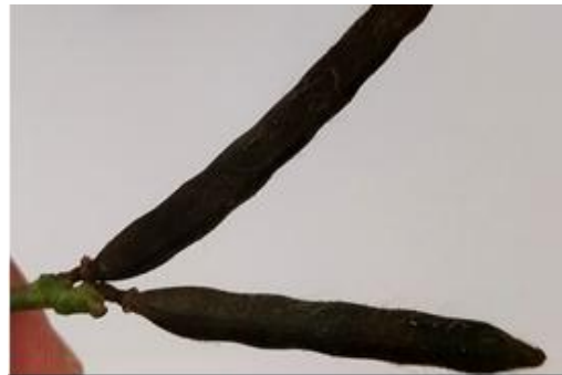
DIFFERENCES IN SEED QUALITY