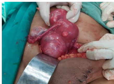
Fig. 2. Showing associated multiple leiomyoma of uterus