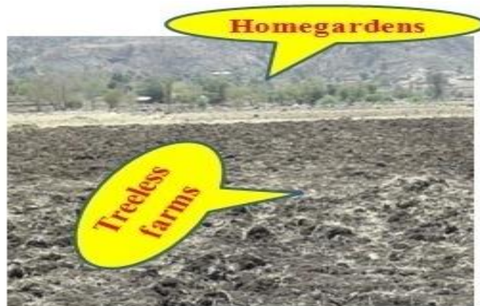
Fig. 3. Photo showing HAF and MCS

Fifteen households were purposely selected for having HAF and MCS as well as proximity of the land use types on the highest possible biophysical similarity such as slope, elevation, soil types and land size (Fig. 3) except their differences in the land management practices. Hence, a total of 30 sample plots (in this case farms), from the selected 15 farming households (one HAF farm and one mono-cropping farm from each household) were used. For the purpose of this study, the fifteen households were considered as replications, whereas the two land use types were considered as treatments. Thus, 30 plots (2 land use types * 15 replications) were used to compare the two land use types. The plots of the MCS were adjacent to the plots in the HAF at a distance of 10m-20m from the edge of the HAF.