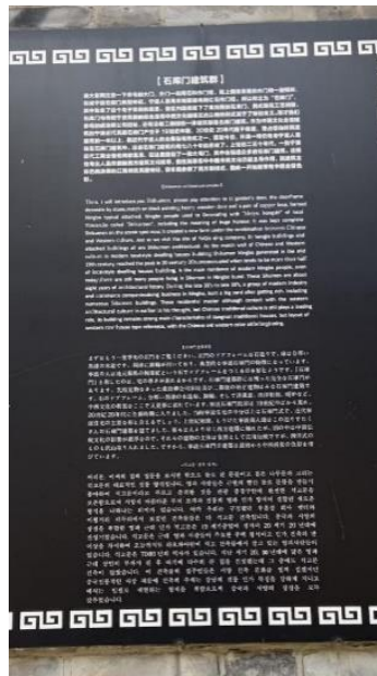
Fig. 3. Shikumen architectural complex

In conclusion, official signage is more standardized impacted by policy, which aims to convey informative communication [46] While private sign is less influenced, it is more diversified and international, which exerts an important role in attracting tourists.