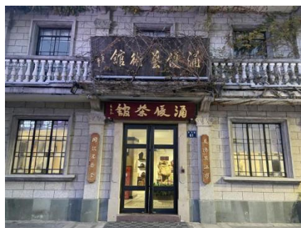
Fig. 5. A tea shop in Old Bund