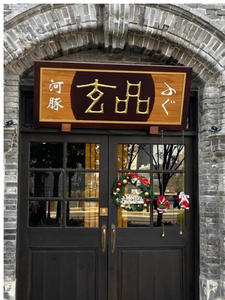
Fig. 7. A restaurant in Old Bund

In conclusion, shop owners can choose languages based on their preference without lots of restrictions and regulations. In terms of the language choice, most shops adopted the combination of Chinese and English to offer clear information for foreign tourists. Additionally, simple Chinese characters are the most commonly applied and are often put in the center of signage due to its informative function and dominant status. While the traditional shops often use traditional Chinese characters, most participants thought that the traditional Chinese characters is elegant and attractive but with little informative function.