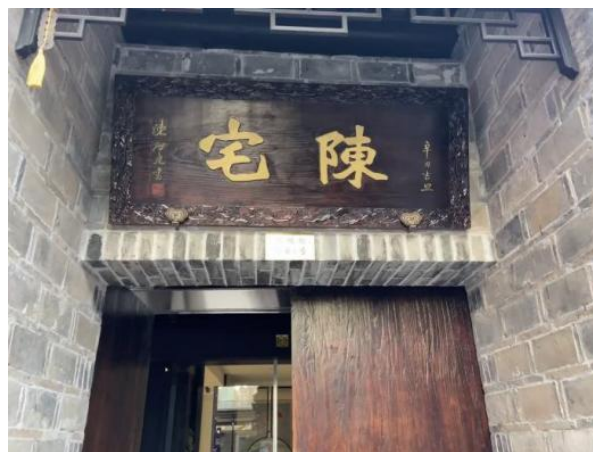
Fig. 6. Chen house

26.1% tourists maintained neutrality. These tourists including the domestic and the overseas, had a taste for the language signs written by traditional Chinese and the buildings featured in Jiangnan town like Chen House (Fig. 6). They expressed their opinion that living in big cities who were surrounded by modern and international linguistic landscape, it was a good chance to enjoy the traditional culture, and ancient atmosphere. And they expected to experience the authenticity of the place. And 10.2% tourists were negative to the linguistic landscape, because they said that they could get the meaning offered by some private language signs due to cultural differences or incorrect translation. Interestingly, approximately 23.7% tourists paid little attention to the language signage, they responded that they came into a shop just for its distinctive decoration or they could ask shopkeepers for help. There were some traditional buildings featured with Chinese and Western culture, so 32.9% tourists highly noticed the language signs on the wall for deeper insight into its background and development.