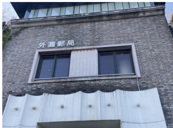
Fig. 2. Y-Town Post Office

In terms of bottom-up linguistic landscape, as is presented in Table 3, we separate the language signs based on their business attributes. Opportunities are presented by groups with various backgrounds by communicating and making contacts, they can adjust and construct social identities and values with consciousness and persistence with the help of translanguaging practice [44] Obviously, bilingual composition is the most used type (N=53, 65.4%), this language combination in private landscape is flexible and has plenty of choice compared with the same classification in top-down landscape (Fig. 4), while monolingual-Chinese is the second preferred language (N=30, 34.6). Specifically, catering industry embraces bountiful language signs and choice (N=21, N=42), and coffee, drinking or tea stores arrive at 28, consisted of Chinese+English (N=27), and Chinese+Pinyin (N=1). Due to the cultural exchange and globalization, delicacy from different countries is increasingly accepted by Chinese [45]. There are two restaurants serving for Japanese cuisine. The rest of canteens provide Chinese food, so monolingual signs have greater proportion (Fig. 5), which plays a major role in information transmission. However, firms are second to food and beverage sector (N=7).