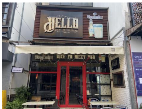
Fig. 4. A bar in the bar street

The discussion should not repeat the results, but provide detailed interpretation of data. This should interpret the significance of the findings of the work. Citations should be given in support of the findings. The results and discussion part can also be described as separate, if appropriate.