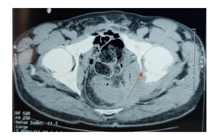
Fig. 8. Osteolytic bone metastasis in the pelvis