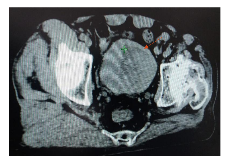
Fig. 2. (CT scan): Large intravesical tumor

Fig. 1. Bladder ultrasound: tissue processes of the left posterolateral and intradiverticular bladder wall