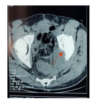
Fig. 6. Bone metastase