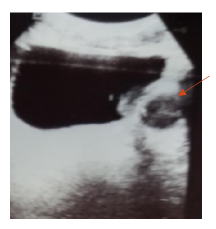
Fig. 1. Bladder ultrasound: tissue processes of the left posterolateral and intradiverticular bladder wall

Osteolytic bone metastasis in the pelvis (Fig. 8).