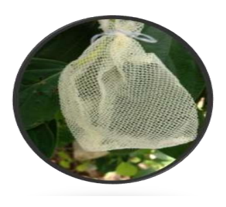
Plate 1 – Treatment (FW<sub>1</sub>)

In the second treatment, (FW_2) three to five inflorescences were selected and covered by nylon net to understand the role of both wind and gravity. The inflorescence of lower spike was emasculated and bagged (Plate 2). The fruit set on the lower spike would be due to the pollen from the above spikes and/or those brought by the wind.