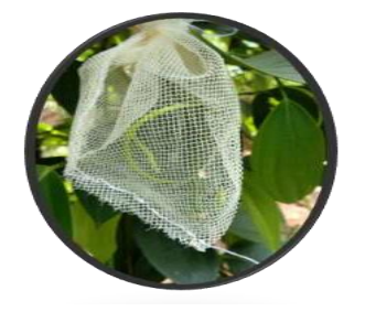
Plate 2 - Treatment (FW<sub>2</sub>)

The third treatment (FC<sub>2</sub>) included twenty-five inflorescences in the field grown pepper plants. A few fully developed flowers before the start of anther emergence were marked and the remaining portion of the spike was removed and covered by polythene. The stamens were emasculated and covered by polythene to avoid wind, insects and rain. The fruits if formed can thus be due to apomixes.