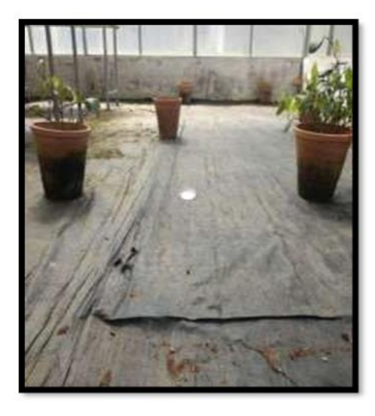
Plate 5. 2.0 m between the plants in polyhouse (wind pollination) in polyhouse(wind pollination)

Plate 4. 1.5 m between plants in the in polyhouse (wind pollination)