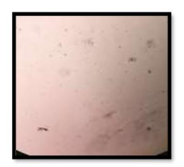
Plate 6a – Petri plate at 4.5 m between plants in field

Pooja et al.; J. Adv. Biol. Biotechnol., vol. 27, no. 3, pp. 18-26, 2024; Article no.JABB.114182