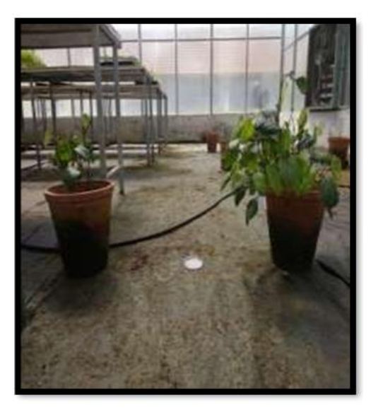
Plate 4. 1.5 m between plants in the in polyhouse (wind pollination)