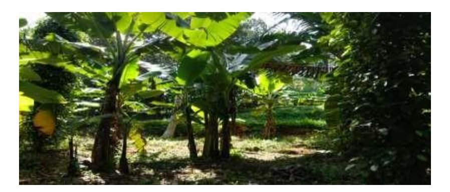
Plate 3. 4.5 m between the plants in the field grown black pepper

Pooja et al.; J. Adv. Biol. Biotechnol., vol. 27, no. 3, pp. 18-26, 2024; Article no.JABB.114182