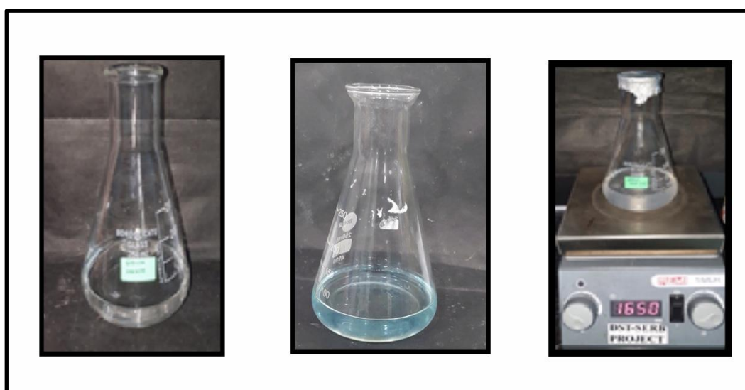
Fig. 2. Preparation of Musa Sapientum copper nanoparticles