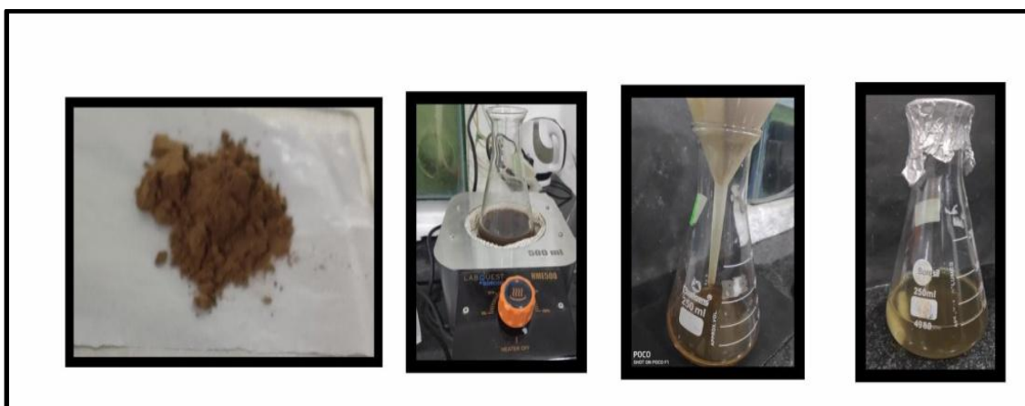
Fig. 1. Preparation of Musa sapientum stem extract

UV-Vis spectroscopy was used for monitoring the signature of CuNps. This is a powerful tool for the characterization of colloidal particles. Metal particles are ideal candidates for study with UV-Vis spectroscopy since they exhibit strong surface plasmon resonance (SPR) absorption in the visible region and are highly sensitive to the surface modification. The presence of CuNP was confirmed by SPR property.