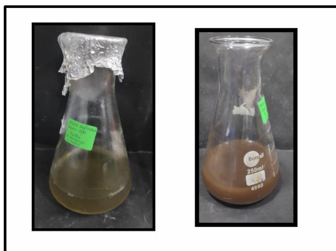
Fig. 3. Colour change from light green colour to brown colour