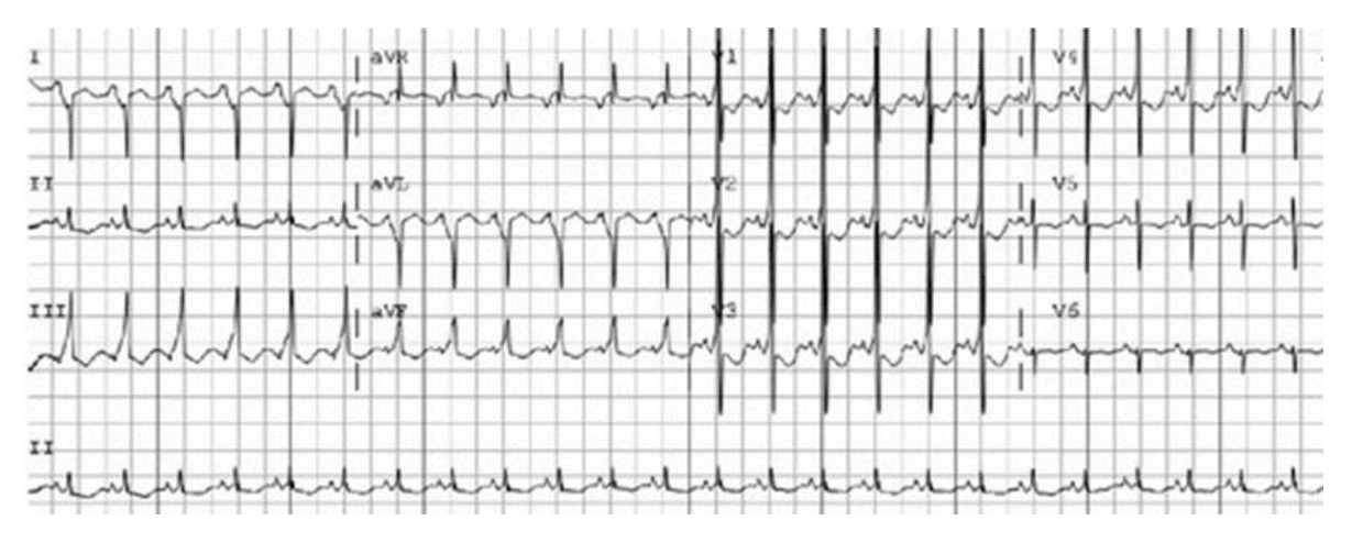
Fig. 1. Patient ECG

"ATG is a monomeric immunoglobulin G (IgG) obtained from the serum of horses or rabbits immunized with human thymus lymphocytes. It is a lymphocyte-selective immunosuppressant" [1]. "The most commonly reported side effects of treatment with ATG are fever, chills, leukopenia, thrombocytopenia, and dermatologic manifestations (rashes, urticaria, pruritis, wheal, and flare)" [1]. Adverse cardiovascular reactions that have been reported in association with ATG include myocarditis, "cardiac irregularity," chest pain, hypertension, hypotension, tachycardia, and bradycardia.