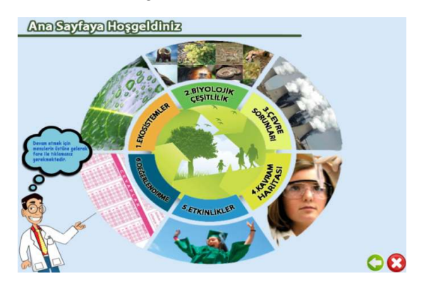
Fig. 4. The main page of the software Note 4: The content of the software: 1. Ecosystem; 2. Biological variety; 3. Environmental problems; 4. Concept map; 5. Activities; 6. Evaluation

In the next phase, the students are directed to the main page of the software, and the knowledge has been taught by step by step. The content of the software is collected under six headings (Fig. 4). Ecosystems, Biodiversity and Environmental Issues are designed through expository learning approach. Concept maps, Activities and Evaluation parts are prepared for promoting persistence in students' learning. They are prepared through learning with fun principle. In the evaluation part, text exams are administered to determine if the students' reach the instructional goals or not.