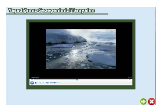
Fig. 1. The entrance part of the Software (Note 1: Let's learn our environment)

In the content of the study, a software for "Human and Environment" Unit in K7 Science and Technology curriculum has been developed through Ausubel's Expository Learning approach. The software has been prepared by using C# programming language. In addition to the C # programming language, Adobe Flash CS6 for animations and Adobe Photoshop CS4 for the organization of pictures have been used. Visuals and animations used in the software is designed according to the age and developmental characteristics of the students. Multimedia design principles such as taking students' attention, reminding the goals of the lecture, reminding knowledge of the preliminary students. presenting stimulus materials, guiding students, evaluation and giving feedback have been considered. For this aim, an interesting image is presented in the entrance of the software, by this way students' attention is drawn to the material (Fig. 1). One of the basic principles of expository learning is active participation of students. Therefore, interesting visual material is chosen to draw the attention of the students.