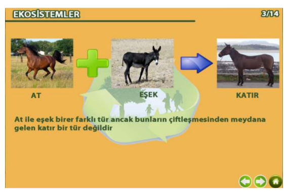
Fig. 6. Presenting and identifying contrasting examples

In the next stage, some contrasting examples are presented to the students (Fig. 6). Thus, at this stage, students can compare the characteristics of the examples and contrasting examples.