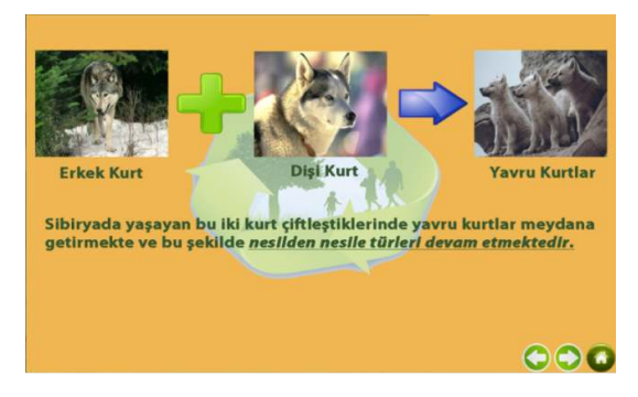
Fig. 5. Giving examples and making identifications

In the software, before teaching new concepts, students are reminded the prior concepts which they have. In the lecturing part students encounter some examples related to the subject (Fig. 5). While giving examples, some visual materials related to the concepts are used. By this way, it is aimed to increase students' motivation on the learning subject.