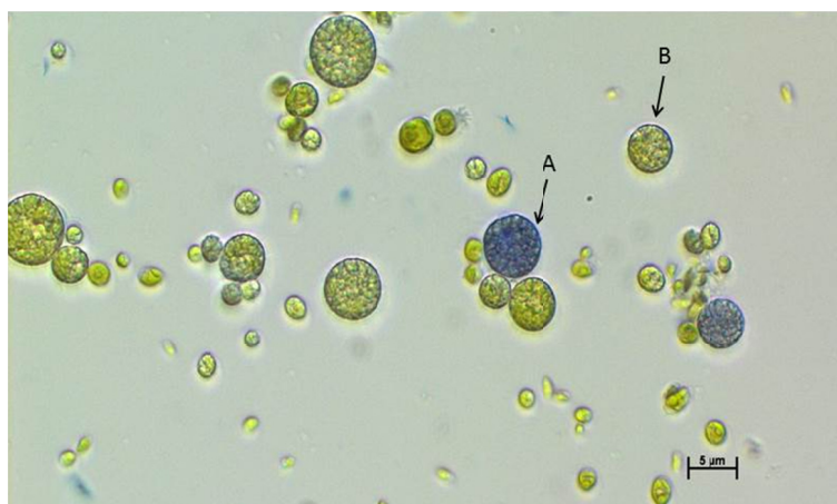
Figure 3. Optical photomicrography of Chlorella vulgaris cells using Trypan blue after different freezing periods. (A) stained nonviable cells; (B) unstained viable cells

This assay quantifies cell viability by measuring the percentage of cells with permeabilized plasma membranes. The membranes of dead cells and cells damaged by freezing are ruptured and allow the dye to enter the