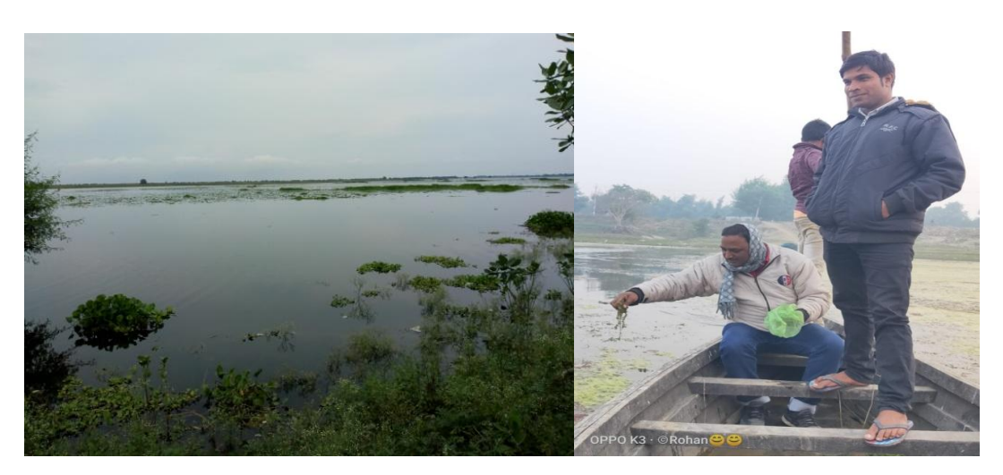
Fig. 3. Floating and submerge aquatic weeds in Bhagar Oxbow lake, in Dumraon

Prasad et al.; CJAST, 39(28): 145-153, 2020; Article no.CJAST.60694