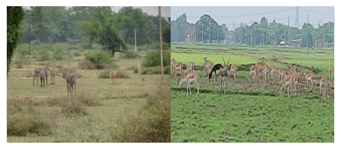
Fig. 4. Nilgai, Boselaphus tragocamelus & blackbucks, Antelope cervicapra in Dumraon