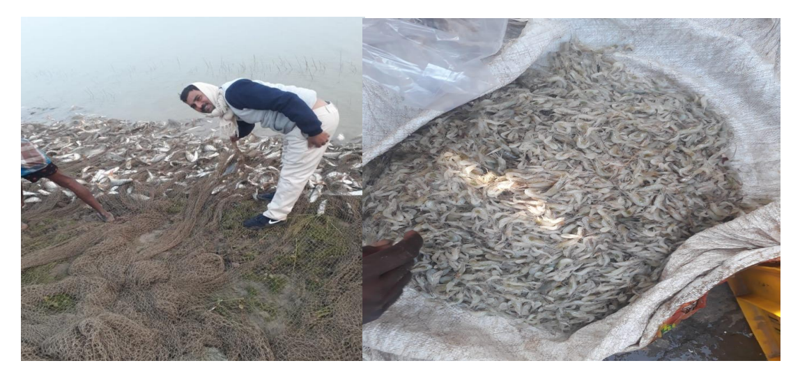
Fig. 5. Fin fishes and shell fishes harvested from the Bhagar oxbow lake in Dumraon