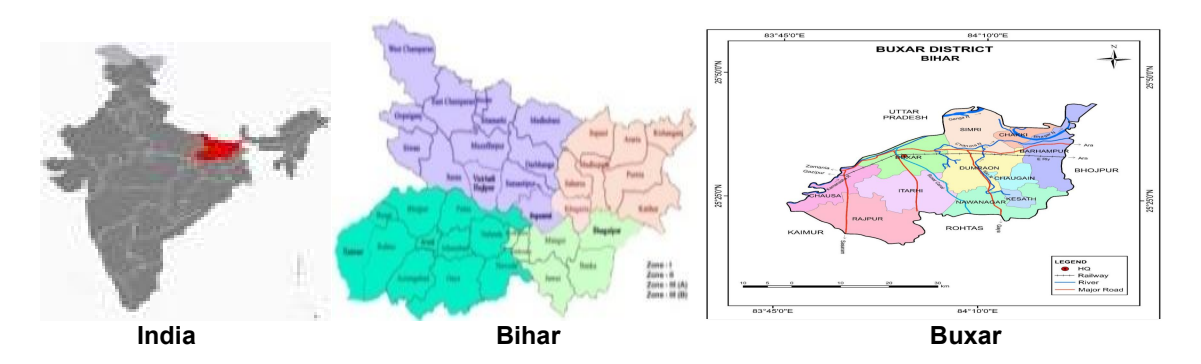
Fig. 1. Map of India, Bihar, and District Buxar showing study area