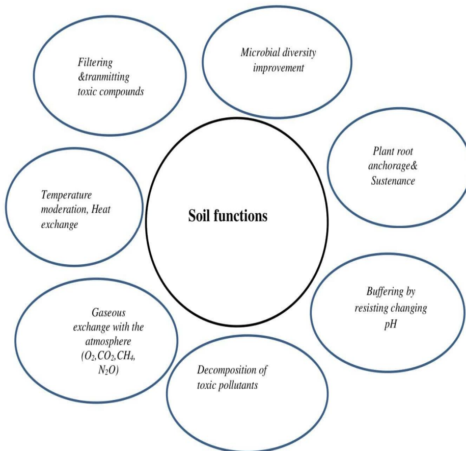
Fig. 1. Illustration showing various functions of the soil [3]

organic matter content in surface soils and clay content in subsurface soils [4]. Soil is considered as an important habitat for a wide variety of living things [5]. Further, the decomposition of soil organic matter is achieved by the collective action of soil fauna and microorganisms [6]. So the important tool for monitoring nutrient status of the soil, agriculture sustainability and environmental health is the soil fauna [7]. The soil fauna is influencing the various processes in soil including retention, breakdown, and incorporation of plant remains, nutrient cycling which in turn affect the soil structure and porosity [8]. Further, the macro fauna such as earthworms, ants and termites play an important role in increasing the soil porosity, creating macro pores, and tunnels which enables movement of water into the soil profile [9,10].