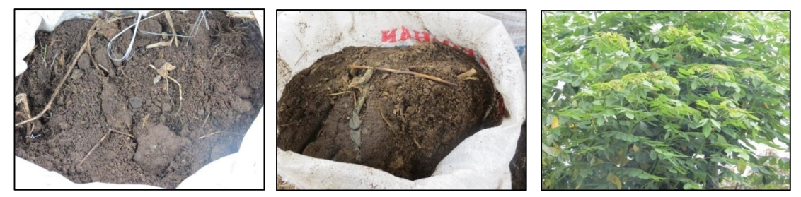
Coffee bean skin (B1)