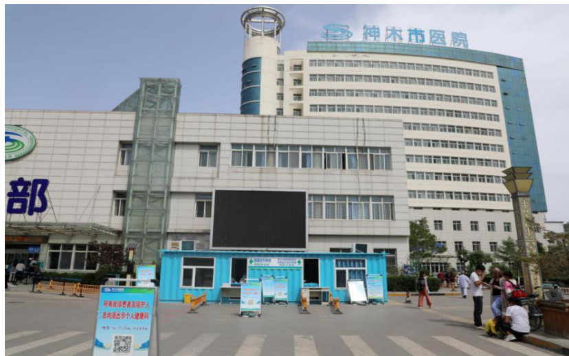
Fig. 1. Shenmu city hospital preview triage of COVID-19

The outpatient visits of 1503 patients with COVID-19 fever and 280 patients with positive COVID-19 were followed up.