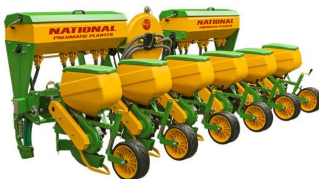
Fig. 10. Pneumatic planter