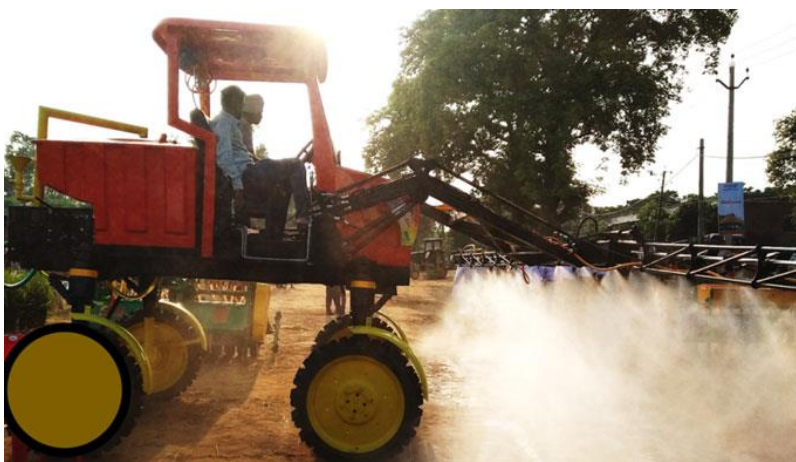
Fig. 16. Self-Propelled high clearance sprayer