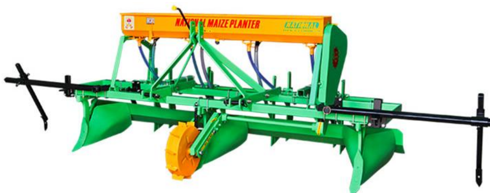
Fig. 12. Wide bed planter