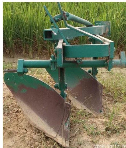
Fig. 2. MB plough