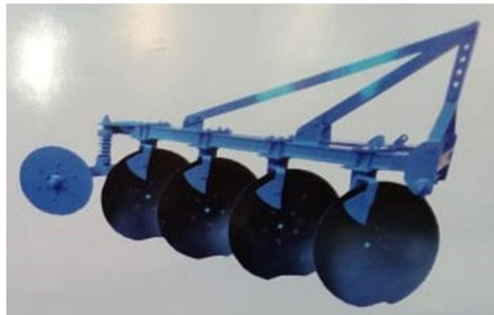
Fig. 3. Disc plough