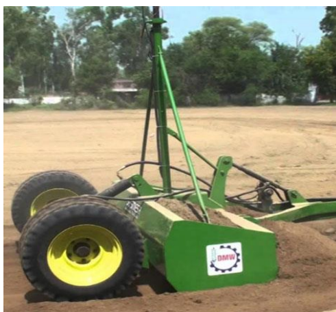
Fig. 6. Laser land leveller