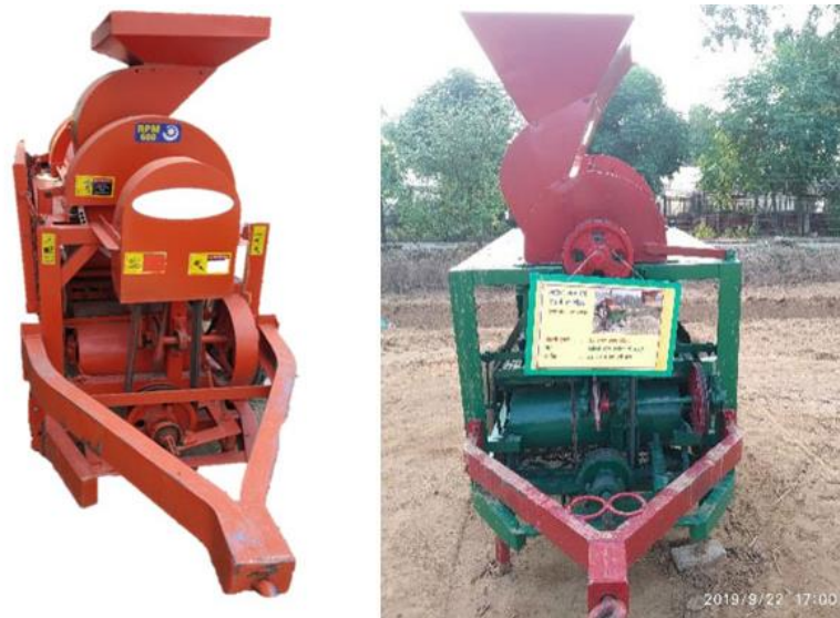
Fig. 18. Maize dehusker and sheller