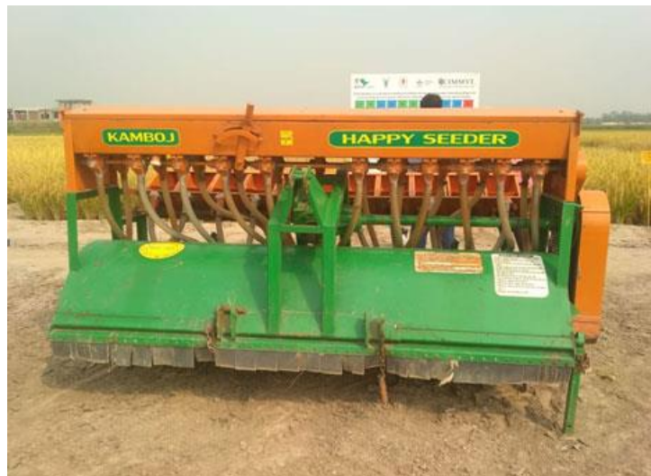
Fig. 11. Happy seeder