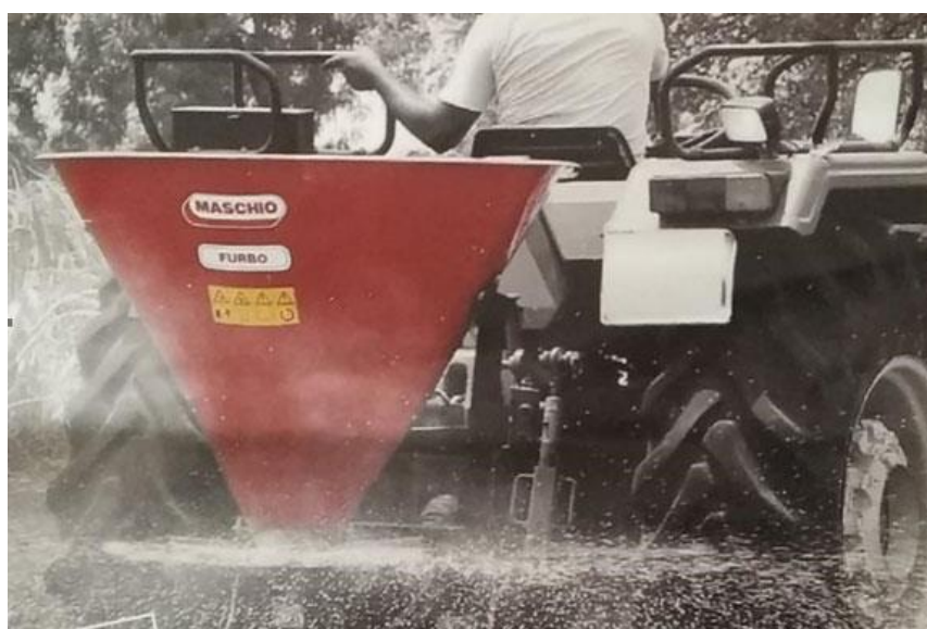
Fig. 13. Fertilizer broadcaster