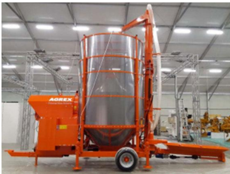
Fig. 19. Grain drying

The dryer is a PTO or electricity-driven, portable, and durable machine suitable for drying various types of grain without the need for pre-cleaning. It is designed to minimize risks of blockages and hot spots. The drying rate ranges from 2 to 10 tons per hour, depending on the crop type, grain moisture content, and other factors [12].