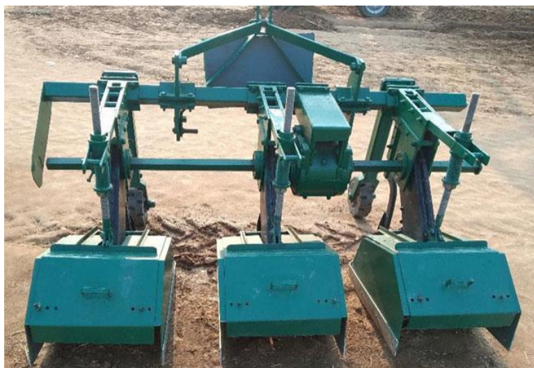
Fig. 14. Rotary weeder