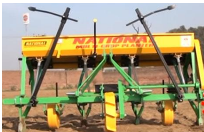
Fig. 7. Multi-crop planter