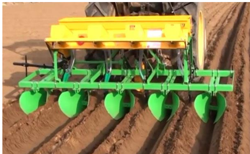
Fig. 8. Ridge planter