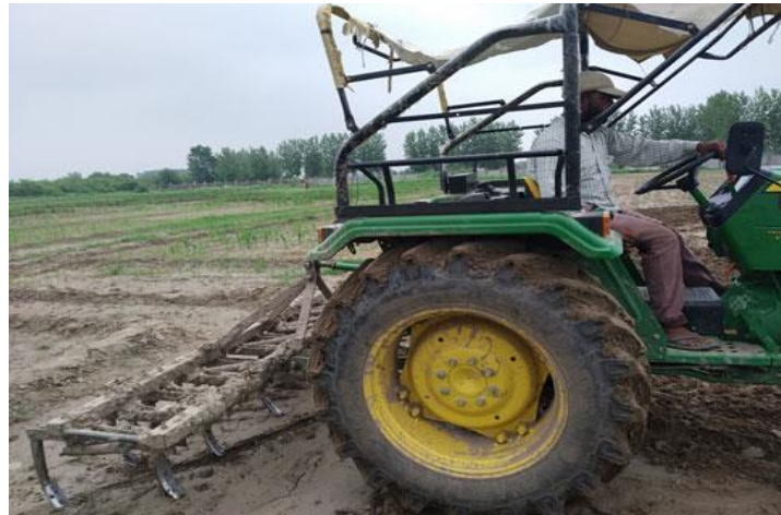
Fig. 4. Tyne type cultivator