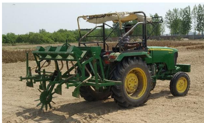
Fig. 9. Zero till planter