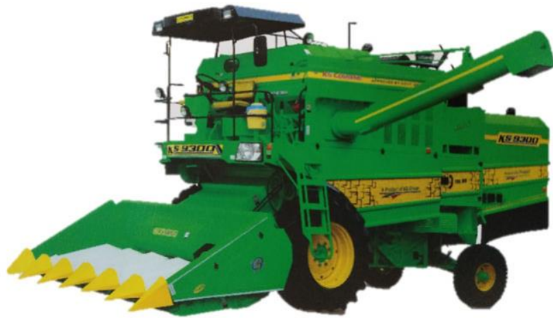
Fig. 17. Combine harvester

In addition to maize, the harvester can be adapted for various cereal crops by changing the header. This versatile machine has the capacity