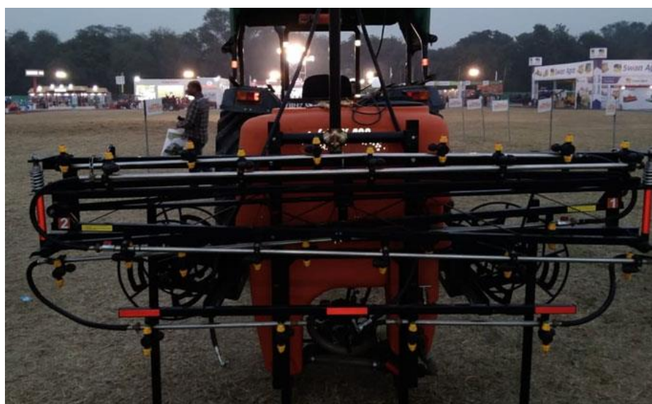
Fig. 15. Boom sprayer