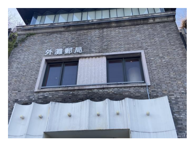
Fig. 2. Y-Town Post Office

In terms of bottom-up linguistic landscape, as is presented in Table 3, we separate the language signs based on their business attributes. Opportunities are presented by groups with various backgrounds by communicating and making contacts, they can adjust and construct social identities and values with consciousness and persistence with the help of translanguaging practice [44] Obviously, bilingual composition is the most used type (N=53, 65.4%), this language combination in private landscape is flexible and has plenty of choice compared with the same classification in top-down landscape (Fig. 4), while monolingual-Chinese is the second preferred language (N=30, 34.6). Specifically, catering industry embraces bountiful language signs and choice (N=21, N=42), and coffee, drinking or tea stores arrive at 28, consisted of Chinese+English (N=27), and Chinese+Pinyin (N=1). Due to the cultural exchange and globalization, delicacy from different countries is increasingly accepted by Chinese [45]. There are two restaurants serving for Japanese cuisine. The rest of canteens provide Chinese food, so monolingual signs have greater proportion (Fig. 5), which plays a major role in information transmission. However, firms are second to food and beverage sector (N=7).