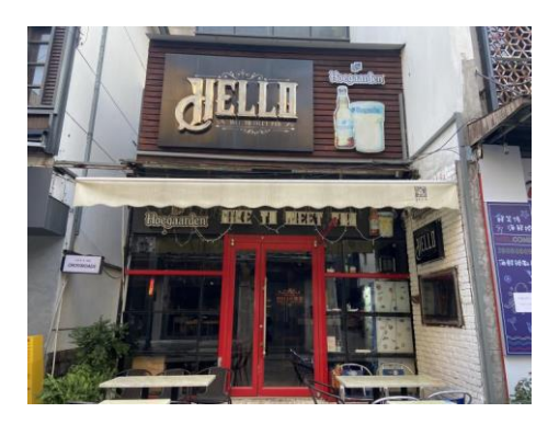
Fig. 4. A bar in the bar street

The discussion should not repeat the results, but provide detailed interpretation of data. This should interpret the significance of the findings of the work. Citations should be given in support of the findings. The results and discussion part can also be described as separate, if appropriate.