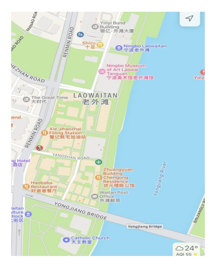
Fig. 1. Location of old bund of Ningbo (LAOWAITAN)