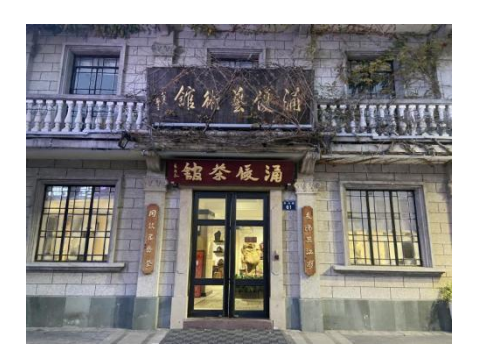
Fig. 5. A tea shop in Old Bund