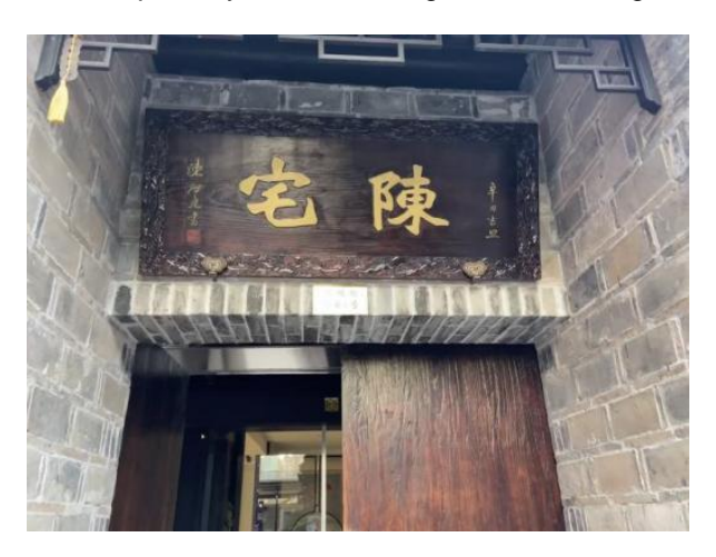
Fig. 6. Chen house

26.1% tourists maintained neutrality. These tourists including the domestic and the overseas, had a taste for the language signs written by traditional Chinese and the buildings featured in Jiangnan town like Chen House (Fig. 6). They expressed their opinion that living in big cities surrounded who were by modern international linguistic landscape, it was a good chance to enjoy the traditional culture, and ancient atmosphere. And they expected to experience the authenticity of the place. And 10.2% tourists were negative to the linguistic landscape, because they said that they could get the meaning offered by some private language signs due to cultural differences or incorrect translation. Interestingly, approximately 23.7% tourists paid little attention to the language signage, they responded that they came into a shop just for its distinctive decoration or they could ask shopkeepers for help. There were some traditional buildings featured with Chinese and Western culture, so 32.9% tourists highly noticed the language signs on the wall for deeper insight into its background and development.