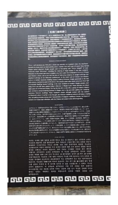
Fig. 3. Shikumen architectural complex

In conclusion, official signage is more standardized impacted by policy, which aims to convey informative communication [46] While private sign is less influenced, it is more diversified and international, which exerts an important role in attracting tourists.