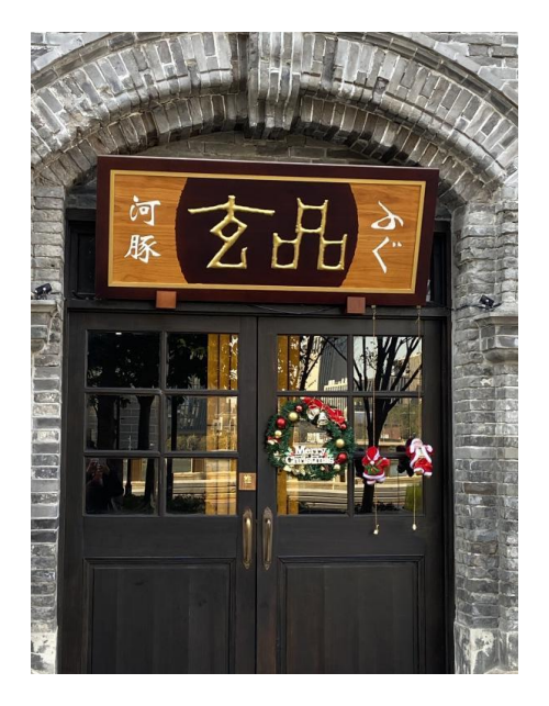
Fig. 7. A restaurant in Old Bund

In conclusion, shop owners can choose based their languages on preference without lots of restrictions and regulations. In terms of the language choice, most shops adopted the combination of Chinese and English to offer clear information for foreign Additionally, simple tourists. Chinese characters are the most commonly applied and are often put in the center of signage due to its informative function and dominant status. While the traditional shops often traditional Chinese characters, most participants thought that the traditional Chinese characters is elegant and attractive but with little informative function.