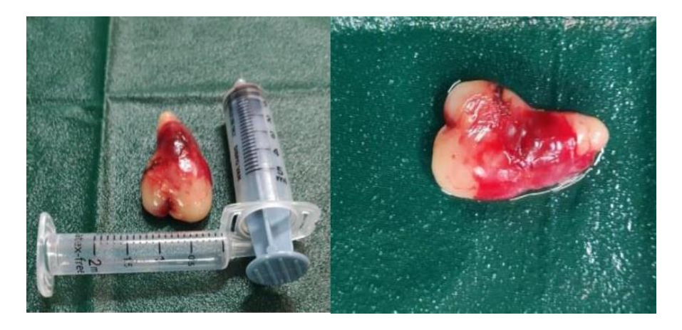
Fig. 3. Excised giant parathyroid adenoma