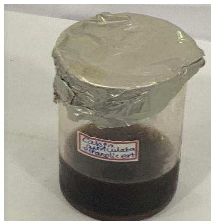
Fig. 1. Cassia auriculata ethanolic extract

The anti-inflammatory activity for Solanum tarvum gel was tested by the following convention proposed by Muzushima and Kabayashi with specific alterations (Pratik Das et al., 2019). 0.05 mL of Solanum tarvum gel of various fixation (10µL, 20µL, 30µL, 40µL, 50µL) was added to 0.45 mL bovine serum albumin (1% aqueous solution) and the pH of the mixture was acclimated to 6.3 utilizing a modest quantity of 1N hydrochloric acid. These samples were incubated at room.