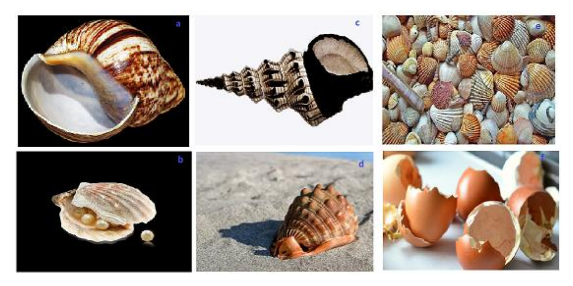
Fig. 1. Differant sea shells (a) snail shell, (b) oyster shell, (c) periwinkle shell, (d) giant conch shell, (e) crustacean shell, (f) chicken egg shell