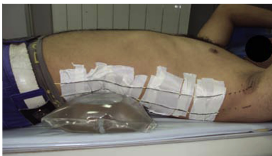
Figure 3 A water bag was placed under the lower part of the abdomen.

the skin, helped in choosing the best site of skin entry in relation to the stones (from the posterior axillary line or mid-axillary line, or in between). All these data helped in the preoperative planning for selecting the most accurate and safest access site for PCNL (Fig. 4).