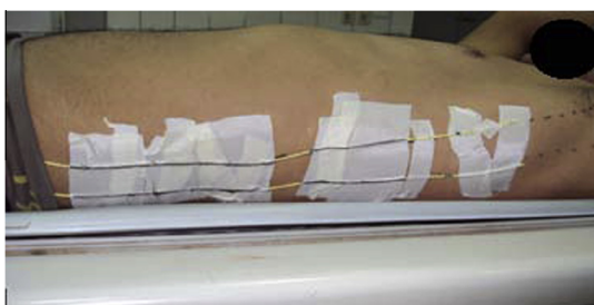
Figure 2 Two ureteric catheters were fixed on both axillary lines.