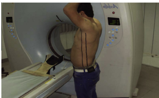
Figure 1 The two lines drawn on the patient represent the mid- and posterior axillary lines.